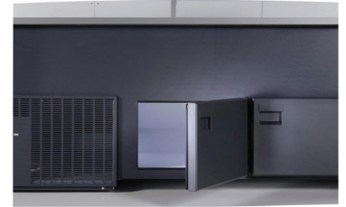
REFRIGERATED REAR STORAGE