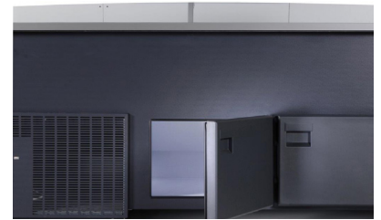
REFRIGERATED REAR STORAGE